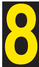
5000 Series 72mm x 44mm

For low temperature applications: B-997 Bradylite® has a cold temperature adhesive. This engineering grade reflective sheeting can be applied at temperatures as low as -10°F (-27°C) making this an ideal material for cold weather use.